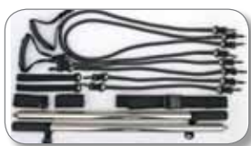
16 Pc. Cal Spas exercise equipment set with storage bag.

Cal Spas swim spas feature a standard fitness bar handle and attachment points for the Cal Flex™ Exercise Equipment.