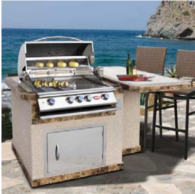
Cal Flame sets a new standard for outdoor kitchens with the 6-foot LBK-402 Cal Flame BBQ Island.

MEDIA CONTACT: Angel Beltran, Public Relations press@calspas.com or 1-800-CAL-SPAS